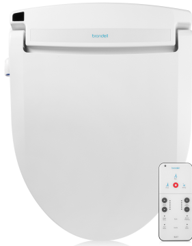
BL97-EW / BL97-RW